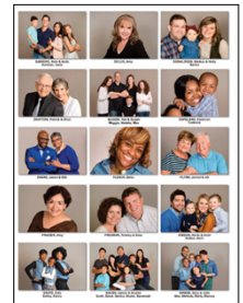
PHOTO SESSION VOLUNTEERS NEEDED

Photos for the new church directory will be taken in June. Online scheduling goes live this week. You can find a link on our website. We will also have volunteers on hand after worship on April 14 & 28 to help you schedule an appointment. The directory won't be complete unless everyone takes part, so be sure to sign up.